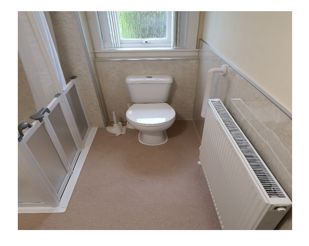
Rhudal Cottages (Before)